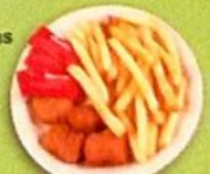
#3 Chicken Nuggets